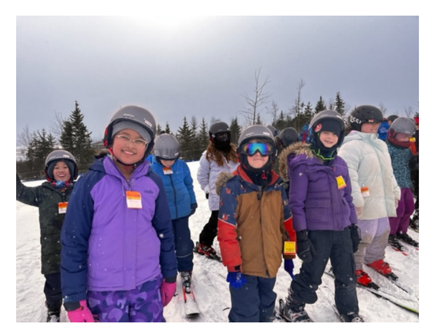
March 4-6 Ski Day