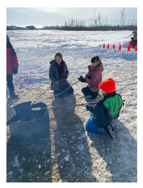
Land Based Learning

Some Other Solutions is a Fort McMurray Resources to support Mental Health and offers counselling and support programs for families.