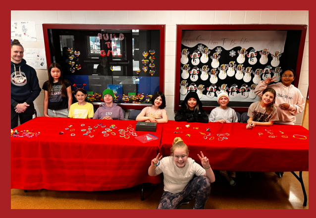
Grade Four SPCA Fundraiser