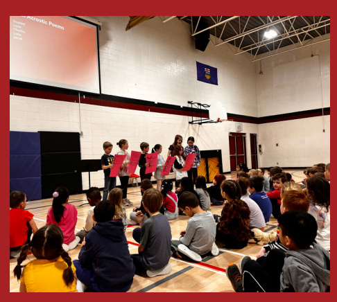
March Assembly Leaders