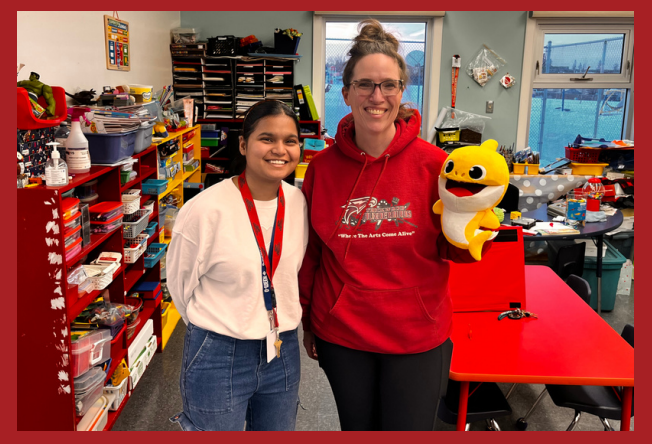
Kindergarten Open House

Orders can be placed by creating an account at the PAC Website: <u>Thickwood Hot Lunches</u> (password TWHL). These lunches would not be possible without our amazing PAC volunteers.