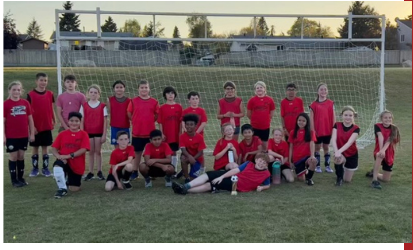
Congratulations to our 5/6 Soccer Team!